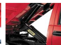
Optional Scissor Hoist Available