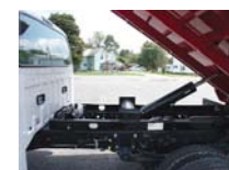
Heavy Duty Sub-frame Construction