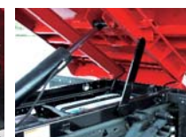
Integral Body Prop