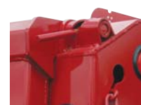
Twist Release Top Gate Pin