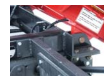
Heavy Duty Pedestal Rear Hinges