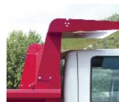
Tarp Holes In Cab Shield