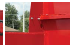
Bolt-On Cab Shield